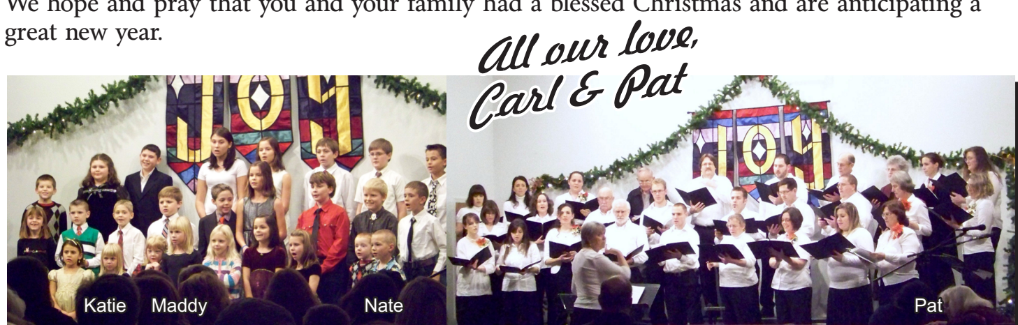
Youth Choir Adult Chorus Cornerstone Church Christmas Concert

We hope and pray that you and your family had a blessed Christmas and are anticipating a great new year.